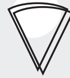
BY THE SLICE Prices & selection vary